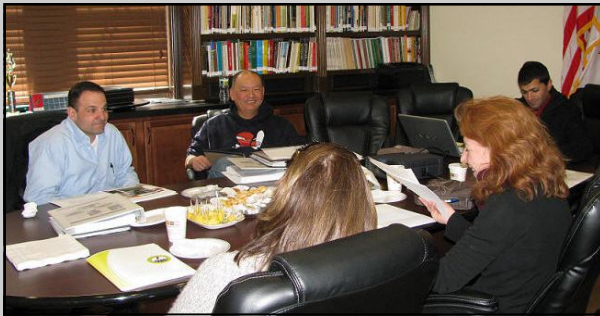
Focus group session held by GenEd with Rhode Island teachers to obtain their feedback on educational materials we are developing

As part of a Rhode Island Council for the Humanities grant awarded to The Genocide Education Project, GenEd is nearing completion of a package of instructional materials highlighting the history of Rhode Island Armenian-Americans who immigrated to the State after escaping the Armenian Genocide. A first-person narrated documentary, accompanied by lesson plans, has been produced. Teacher training workshops are scheduled for 2012.